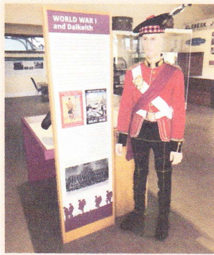
Around 660 visitors came to our WWI exhibition