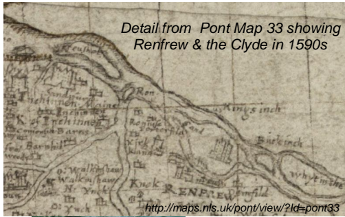
Detail from Pont Map 33 showing Renfrew & the Clyde in 1590s