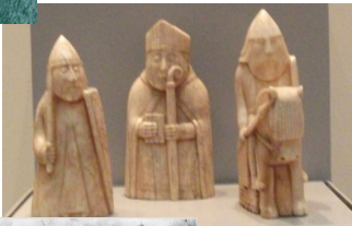
The Lewis Chessmen at the British Museum