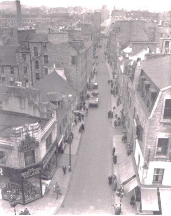
The Wellgate, Dundee, looking north to the Wellgate Steps