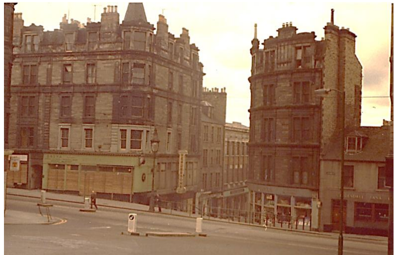
The Wellgate and Victoria Road awaiting demolition in the early 1970s