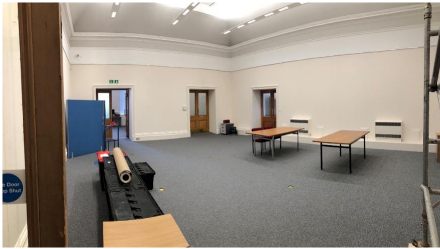
Picture 1: The doors to the left lead to the new 'small search room' (see Picture 2), the middle doors lead to the small onsite store (see Picture 3), and the rightmost doors house the lift from the ground floor of the library.