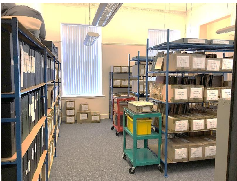
Picture 3: This room is the new onsite store. It will house the photographic collection, the poor and school records, and several collections from the manuscript collection, amongst other items. It is currently the store for the local history collection awaiting its new shelving.