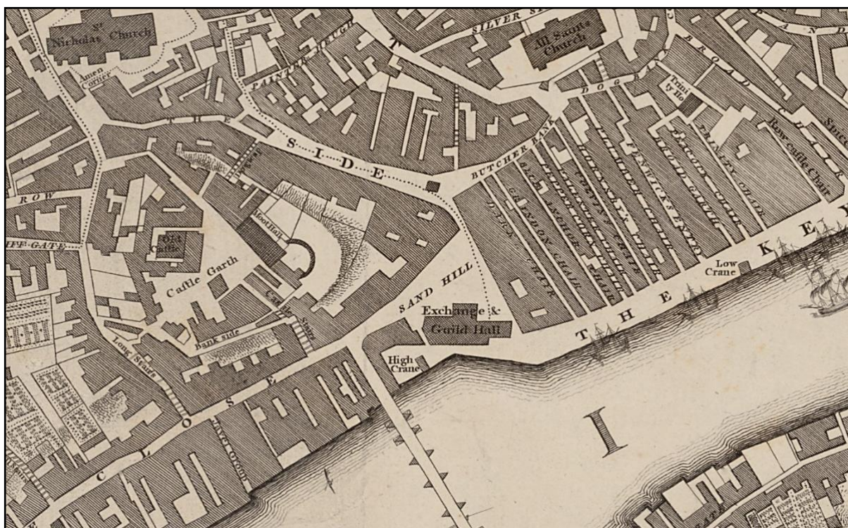
Detail from Charles Hutton, A plan of Newcastle upon Tyne and Gateshead ... (1772)

■ Scottish Council on Archives - Community Stories – Community Archives Skills Sessions The next lot of Community Stories – Community Archives Skills Sessions are now on SCA's Eventbrite. The three topics they will focus on are engaging outreach, preservation and cataloguing. Each webinar is led by one of SCA's consultant archivists and aims to give you confidence in each of these areas. Book via Eventbrite: https://www.eventbrite.co.uk/o/scottish-council-on-archives-18070269599