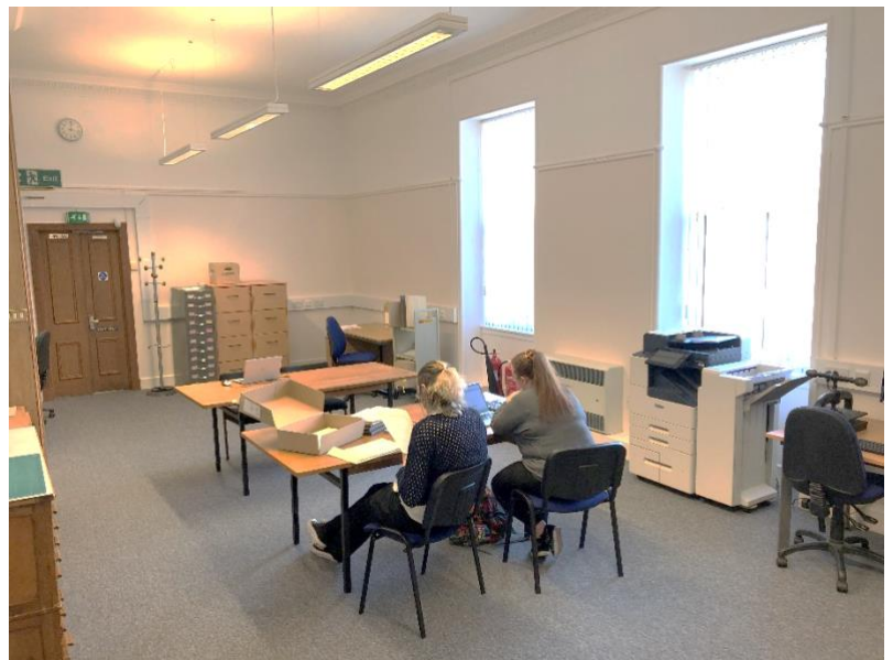
Picture 2: This is the smaller search room. In this space are the microfilm readers and reels, desks for the public to work away from the main search room, the research files, and scanning computers for volunteers.