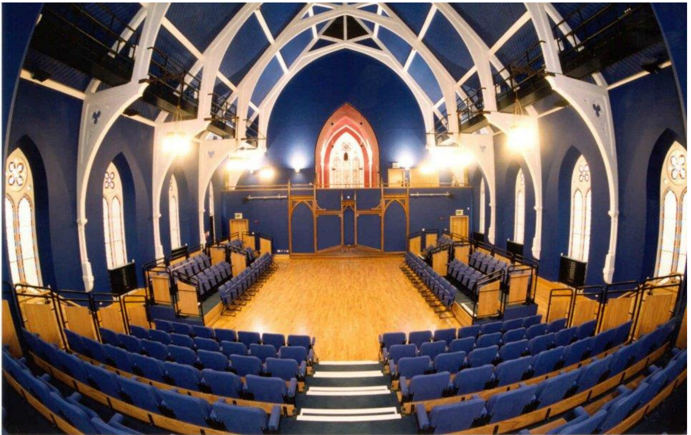
Wynd Centre Auditorium