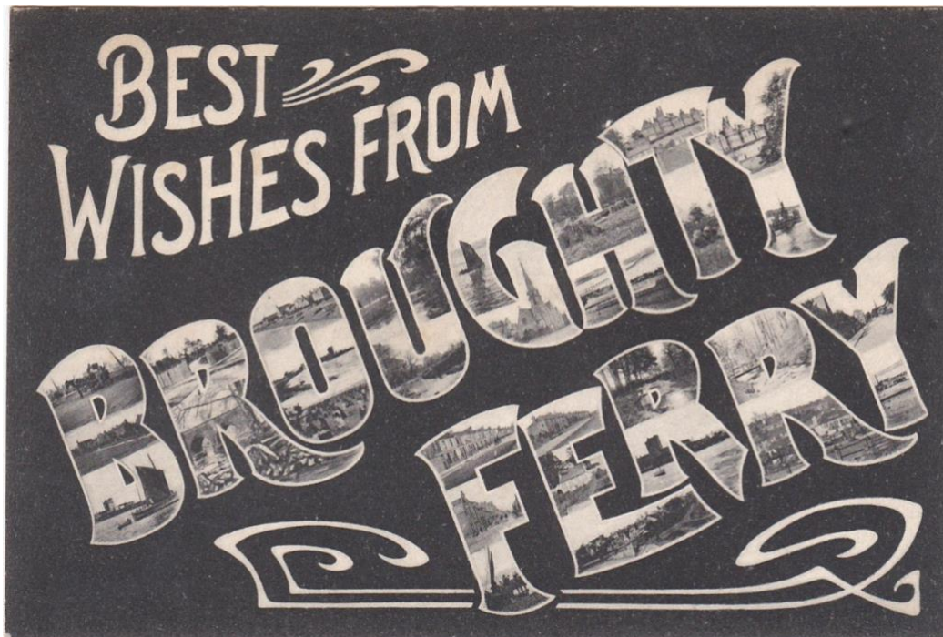
Mary, Queen of Scots (The Antwerp Portrait) and Greetings from Broughty Ferry 'The Brighton of the North'