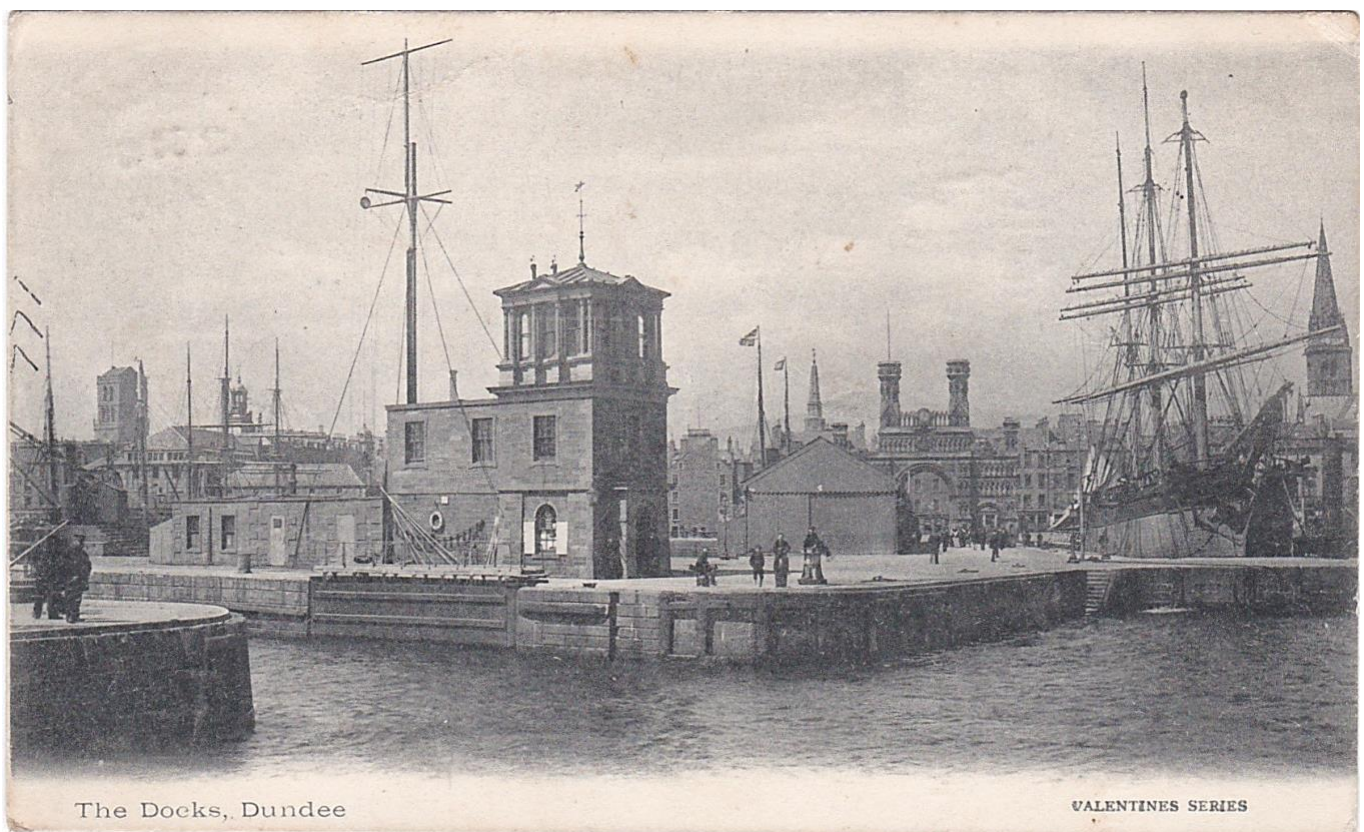
Valentines Series 15 The Docks Dundee