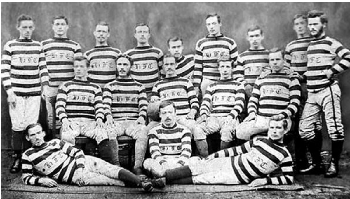
The newly-formed Hibernian team in 1876